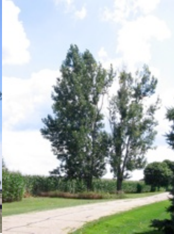
August 9, 2016 Damage progressing quickly