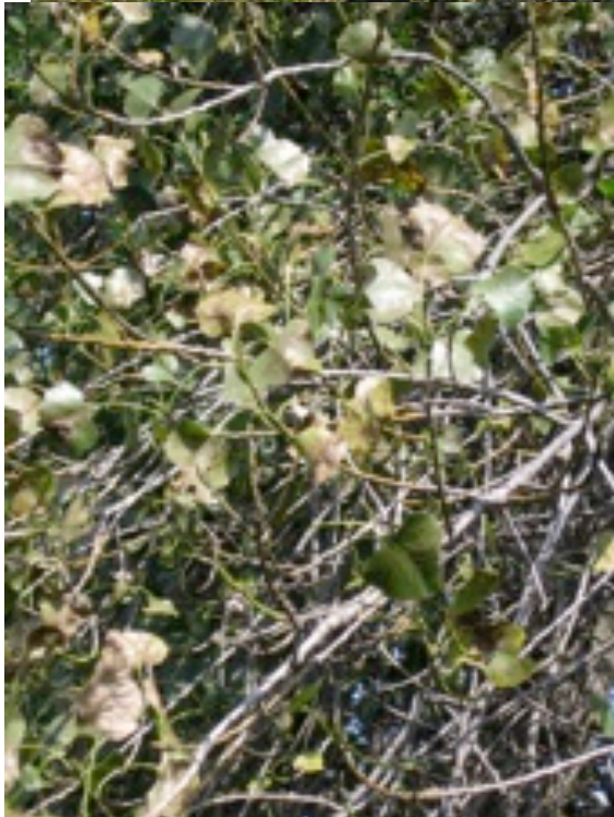
Close-up of leaves from one of the cottonwoods above. Notice necrotic lesions and off color characteristic of RF leaf damage. No normal fall color present, despite on-going leaf drop.