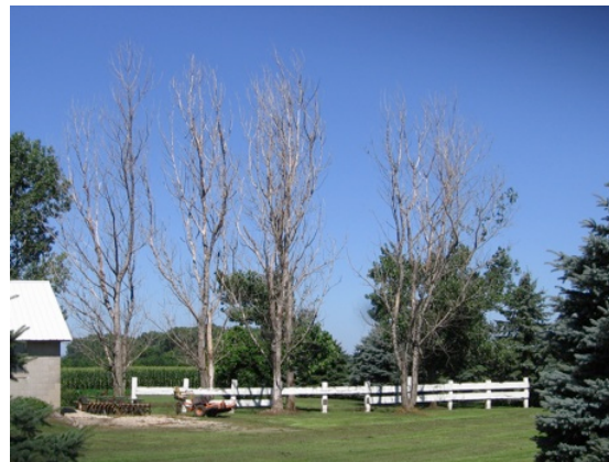
July 24, 2016 These trees began exhibiting damage similar to the trees above in 2015. Most of them greened up in the spring 2016, then had the leaves die and drop. Two still retain leaves low down. Others are completely dead.

Certainly the trees that are worst off in our area are in the willow and poplar families and they are growing in areas that are wet, but I have seen trees of all types exhibiting damage.