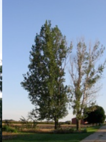
September 12, 2016 More leaves lost. No sign of healthy fall leaf color so fall is not the cause.