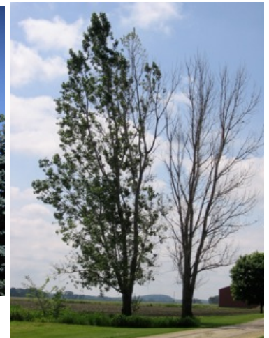
May 26, 2017 - Tree on right now totally dead less that a year after damage first began to

Please think of the future. We cannot live without a healthy tree population. We rely on them for the very oxygen we breathe. No technology is worth endangering something as essential as our source of oxygen.