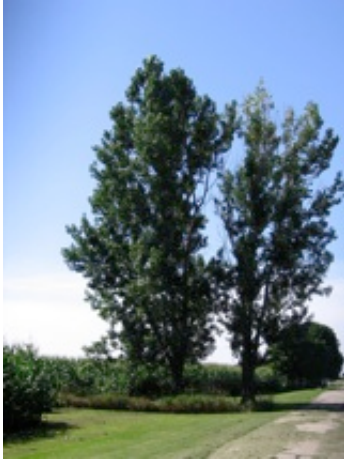
July 24, 2016 Note thinness in tree on right and bare spot developing between trees

The damage to trees is not theoretical. We are seeing it on our farm now. We have seen it in the city for years, but now we are seeing it in the country as well, on a widespread basis.