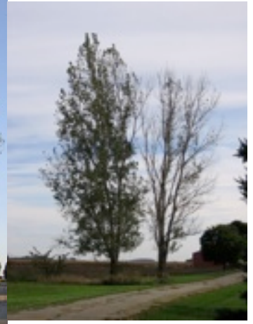
October 10, 2016 Still no fall color, but leaf loss nearly complete in righthand tree.

As you can see the damage to trees is progressing quickly to death. Balimori discusses the fact that " White and black poplars (Populus sp.) and willows (Salix sp.) are more sensitive. There may be a special sensitivity of this family exists or it could be due to their ecological characteristics forcing them to live near water, and thus electric conductivity. "