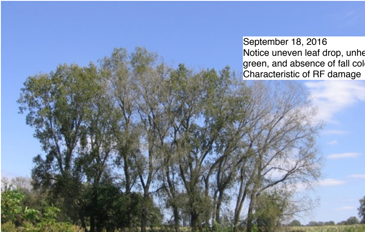
September 18, 2016 Notice uneven leaf drop, unhealthy green, and absence of fall color. Characteristic of RF damage