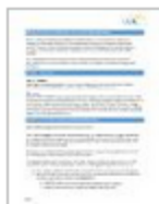
RFCDL Supplement PDF 114 KB