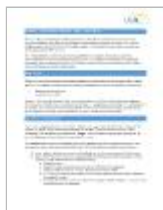
FY 2016 FCDL Supplement PDF 224 KB