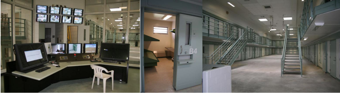
Figure 2. Federal Correctional Institution, Cumberland Maryland: Interior Views

These figures illustrate numerous correctional institutional features, including: