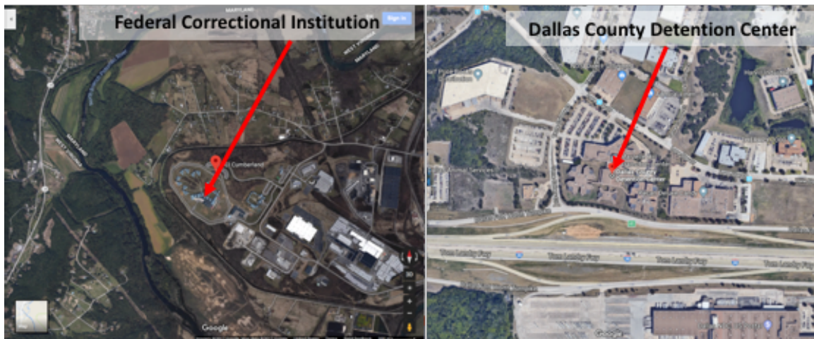
Figure 1. Federal Correctional Institution (Left) and Dallas County Detention Center (Right)

Correctional facilities, both publicly and privately managed, vary widely with regard to size, architectural design, security level and location to name just a few factors. Due to these and other sources of variation, R.F. systems targeted on these facilities will require custom design, installation, maintenance and management. The following figure provides information for two relevant facilities, those being the Federal Correctional Institution, Cumberland Maryland and the Dallas County Detention Center, Dallas, Texas.