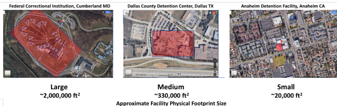
Figure 6. Large, Medium and Small Correctional Facility Working Examples

We are addressing the variability in size by identifying three facility types based on their physical “footprint” (as opposed to inmate population size), those being “large,” “medium” and “small.” Figure 6 shows specific examples for each of these facility types.