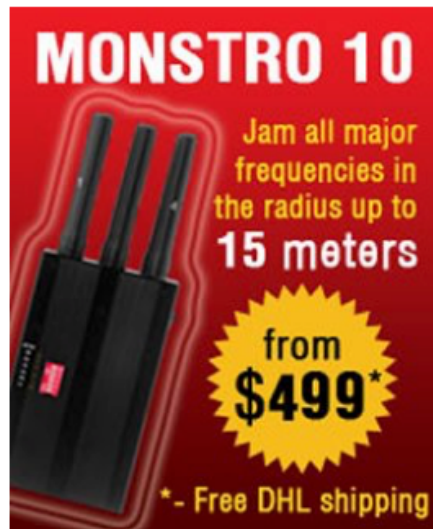
Figure 4. Example COTS Jammer

Our scope excludes readily available, inexpensive, commercial off the shelf (COTS) jammers such as the example shown in Figure 4.