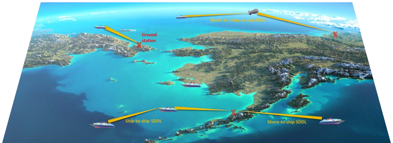
Figure 1: Depiction of Aeronet’s SDDL Networks

By delivering point-to-point bandwidth to each ship, Aeronet avoids having to share spectrum between multiple vessels in congested locations, which sharing has been a limitation for