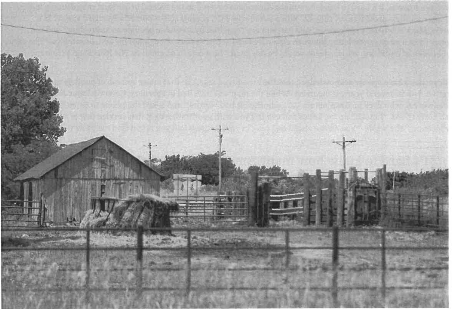
Power lines, operated by Chariton Valley Electric Cooperative, flank a farm in rural Iconium, Iowa

Across the country, politicians with rural constituents are moving to address the problem. Last year, Republican Senator Roger Wicker of Mississippi, Democratic Senator Joe Manchin of West Virginia, and Democratic Congressman Dave Loebsack of Iowa all introduced bills to improve the accuracy of mobile broadband data—also from Form 477—in advance of an FCC funding opportunity for phone companies. Loebsack's bill was signed into law in March as part of the omnibus spending bill.