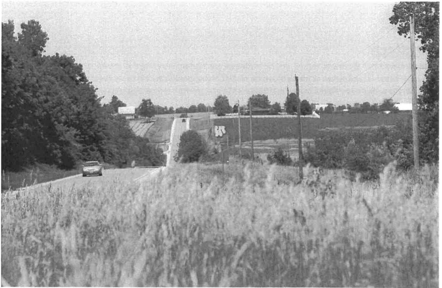
Telephone poles north of Albia, Iowa, carrying phone lines that can be used for DSL connections