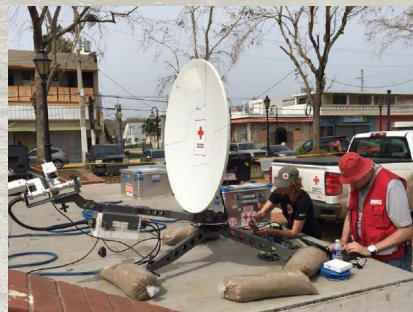
(Above) VSAT terminals restoring connectivity in PR