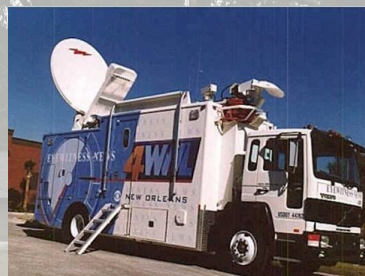
Satellite News Trucks pictured above were deployed following Hurricane Katrina.

Currently, AT&T is using satellite phones and both Verizon and AT&T are deploying satellite trucks in regions hit hard by recent hurricanes in order to restore service. T-Mobile and Sprint are using VSAT terminals to provide backhaul support for restoration of cellular and text service.