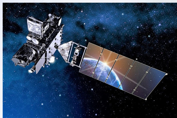
Weather and imaging satellites provide life-saving data to forecasters and emergency officials. (Above) Artist Conception of GOES-R Weather Satellite

As weather predictions are vital to saving lives, the new Lockheed Martin manufactured GOES-R satellites with advanced imaging allows meteorologists and emergency responders to more quickly and accurately predict when and where hurricanes will strike. Spire Global utilizes small satellite GPS-RO weather data critical to industries and people across North America and the world. All this data is crucial as it helps local officials plan life-saving evacuations in areas predicted to be heavily impacted by severe weather.