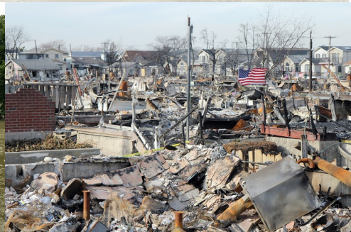
Hurricane Sandy Destruction