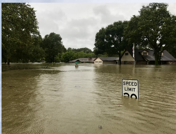
From Aug 27th to Sept 3rd, Hurricane Harvey devastated the Gulf Coast of Texas and Louisiana causing massive flooding and storm damage.