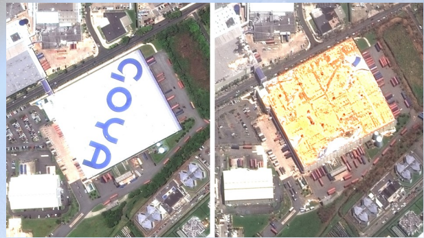
(Above) Before and after Hurricane Maria in PR. (Below) Before and after Hurricane Irma destruction in USVI.

Planet and its constellation of earth imaging satellites is supporting teams of volunteers, humanitarian organizations, and other coordinating bodies in relief efforts with daily imagery updates and analytical tools through its Disaster Response Program