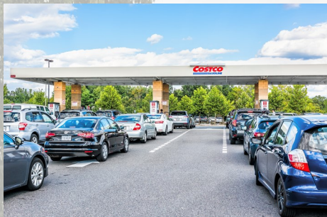
Hurricane preparations—Satellites provide vital debit and credit card authorizations at gas stations and retail stores.

Retailers process everyday purchases using satellite data services before and after a hurricane strikes. Companies such as EchoStar, Hughes and Telesat provide reliable satellite support and business continuity to gas stations, grocery stores and retailers for point of sale (POS) credit/debit card authorizations and inventory management. Consumers purchase fuel, water, food and other essentials to prepare for hurricanes. Satellite data and broadband providers such as Hughes, ViaSat, Inmarsat and Telesat also provide essential lifesaving broadband and VSAT data services to response and recovery agencies, hospitals and others in regions cut off from terrestrial Internet and Wi-Fi.