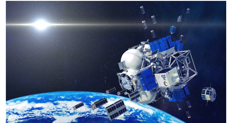
illustration of 73 smallsats from Soyuz Fregat upper stage July 14, 2017