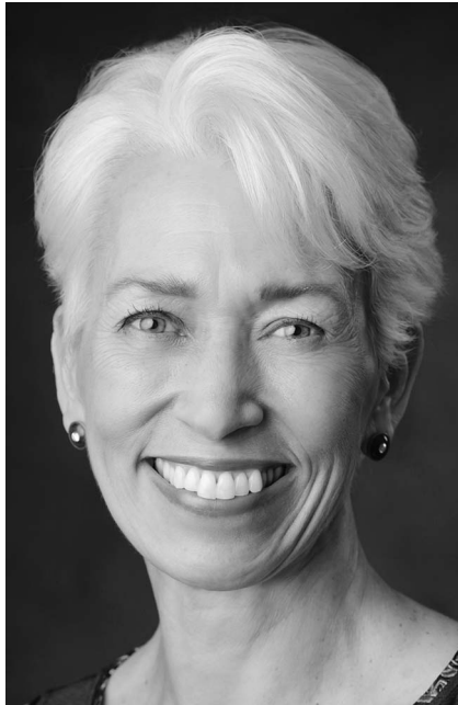
Nina G. Jablonski

Rejection and disrespect may have a more profound effect on youth than older adults. During adolescence, when passion and peer influence are rising but brain systems that support self-control and planning are not fully mature, the typical youth is more likely to engage in risky behaviors, especially in emotionally charged social circumstances (Steinberg, 2008). However, the vast majority do not exhibit violence as a result of extreme reactivity and risky decision making (Frick & Viding, 2009). Moreover, violence could emerge at any time in the life course in reaction to identity-challenging stress and factors that compromise self-control such as substance abuse.