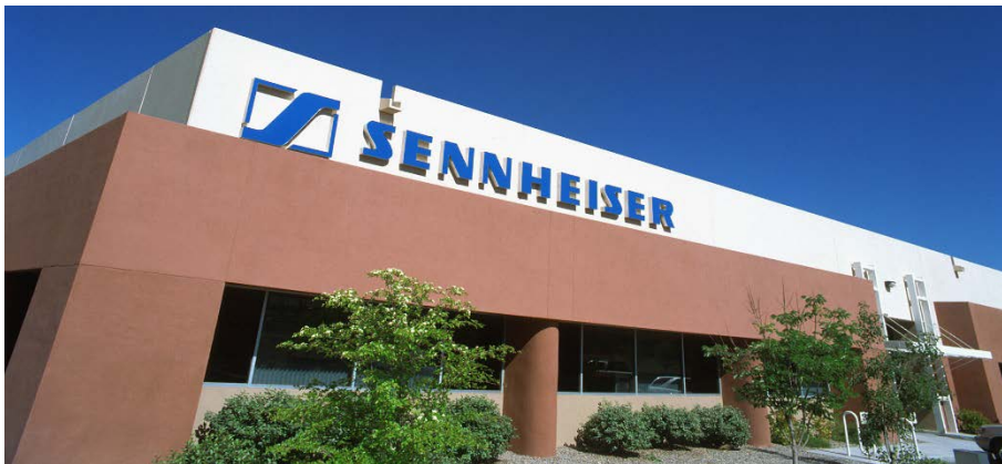
2 Factory in Albuquerque, NM USA