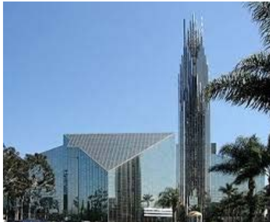
Crystal Cathedral Garden Grove, CA