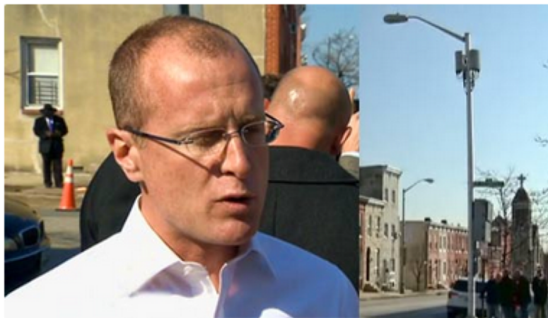
FCC Commissioner Brendan Carr viewed a number of Baltimore's DAS installations yesterday, such as the one at right, but they were cherry-picked by T-Mobile and Crown Castle.

FCC Commissioner Brendan Carr was in Baltimore yesterday viewing small cell sites in the city in a carefully orchestrated presentation by Crown Castle and T-Mobile representatives. A light pole and other small cell installations he viewed during the media event were picture-perfect installations.