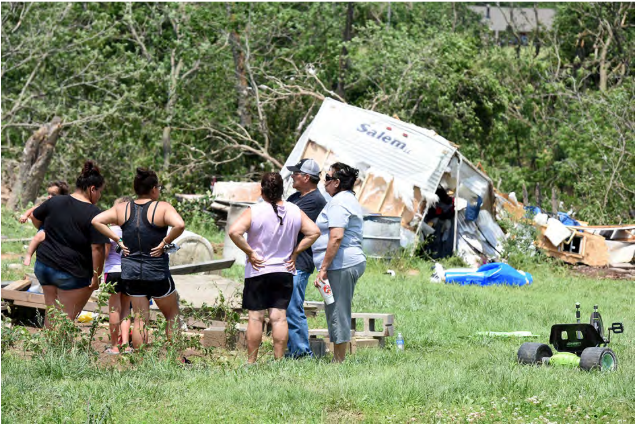
Jay residents survey damage done by a tornado that hit Jay on Wednesday night.