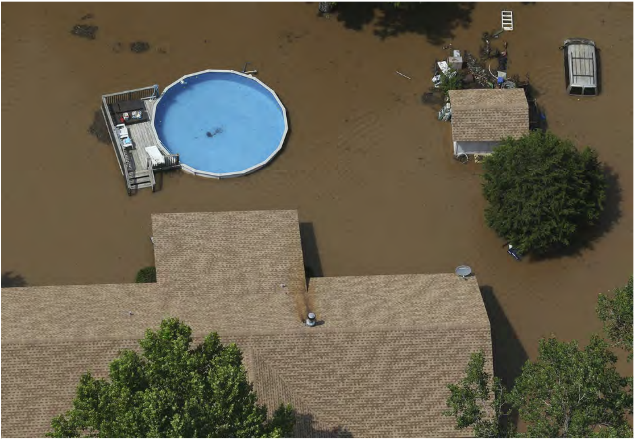
In this aerial image, homes are inundated with flood waters from the Arkansas River near South 145th West Ave near Highway 51 on Thursday, May 23, 2019, in Sand Springs, Okla. Storms and torrential rains have ravaged the Midwest, from Texas through Oklahoma, Kansas, Nebraska, Iowa, Missouri and Illinois, in the past few days.