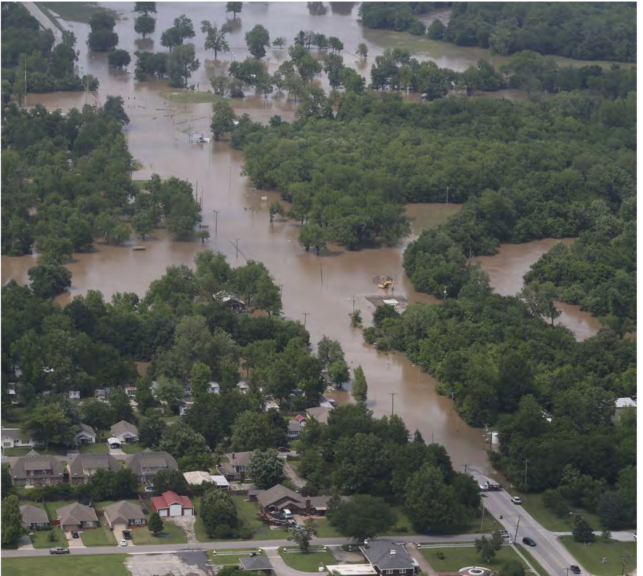
In this aerial image, flood waters are seen on North Cincinnati near Skiatook, Okla., on Thursday, May 23, 2019. Storms and torrential rains have ravaged the Midwest, from Texas through Oklahoma, Kansas, Nebraska, Iowa, Missouri and Illinois, in the past few days.