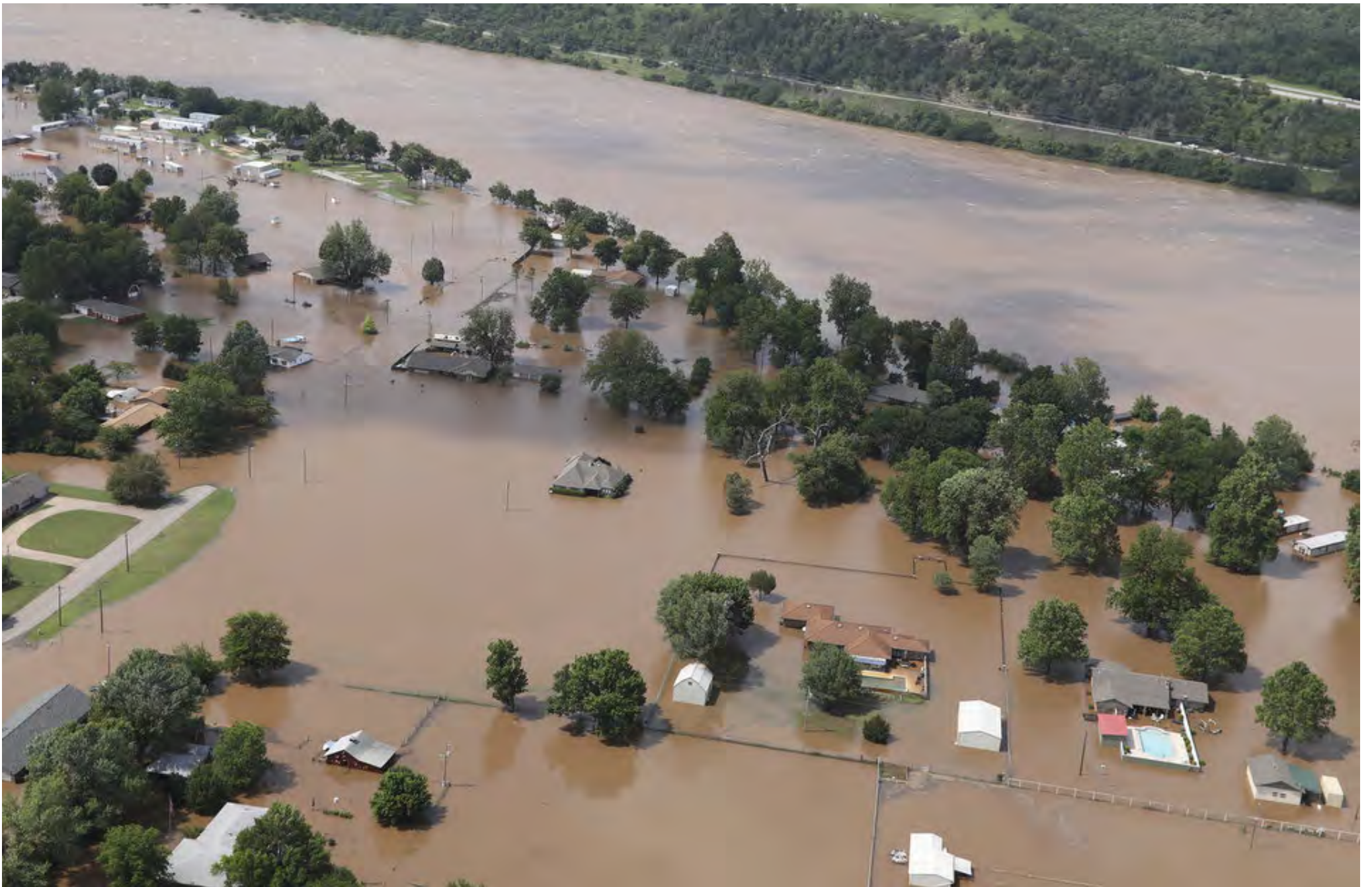
In this aerial image, homes are inundated with flood waters from the Arkansas River near South 145th West Ave near Highway 51 on Thursday, May 23, 2019, in Sand Springs, Okla. Storms and torrential rains have ravaged the Midwest, from Texas through Oklahoma, Kansas, Nebraska, Iowa, Missouri and Illinois, in the past few days.