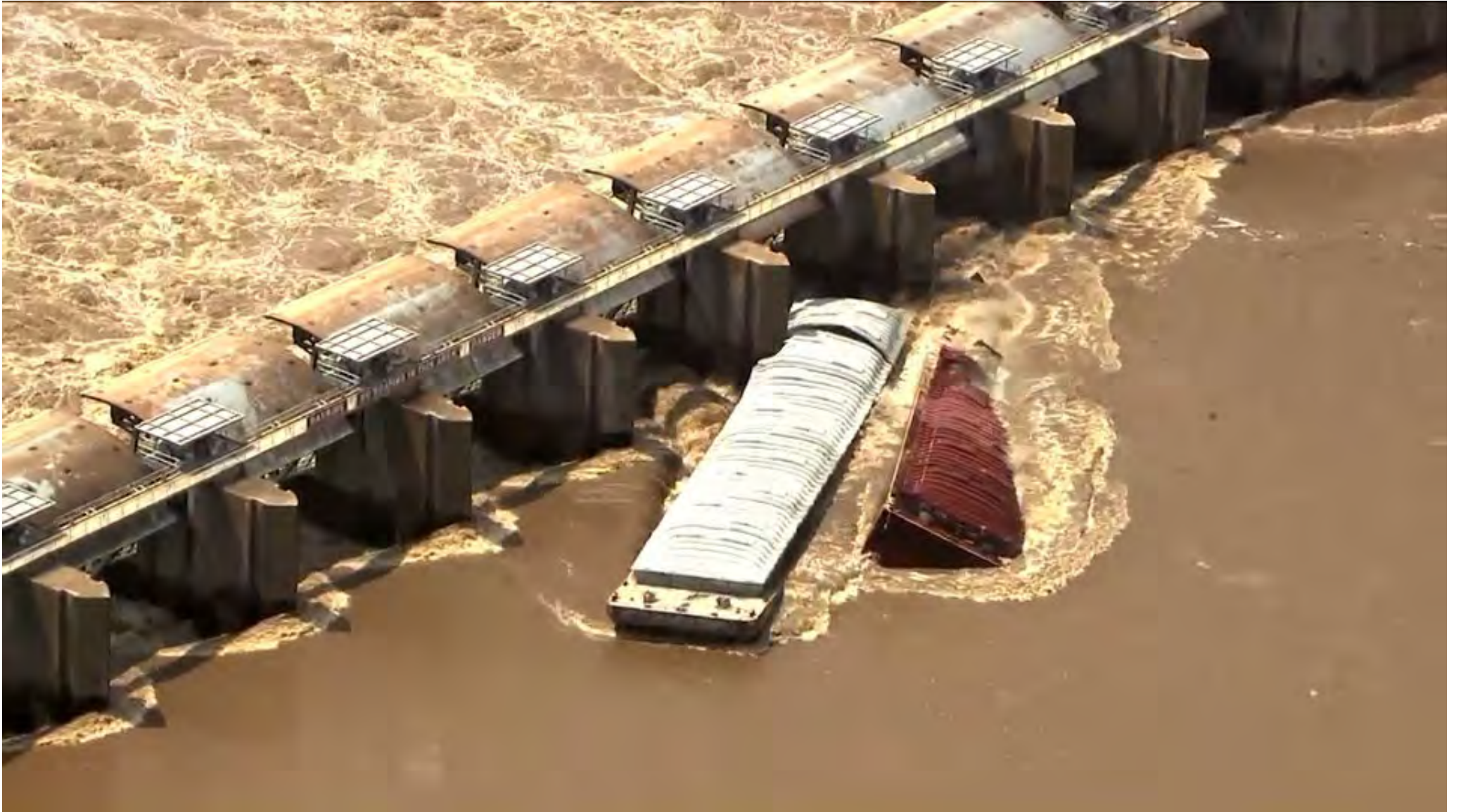
This still image from video provided by KFOR-TV shows two unmanned barges that broke loose on the swollen Arkansas River hours earlier in Oklahoma, crashing into a dam and sinking Thursday, not causing the structure to fail, which officials feared might happen. The barges carrying about 3,800 pounds of phosphate fertilizer between them became unmoored Wednesday night in the Port of Muskogee, Ok., which sits at the confluence of the Arkansas and two other rivers and is about 40 miles southeast of Tulsa.