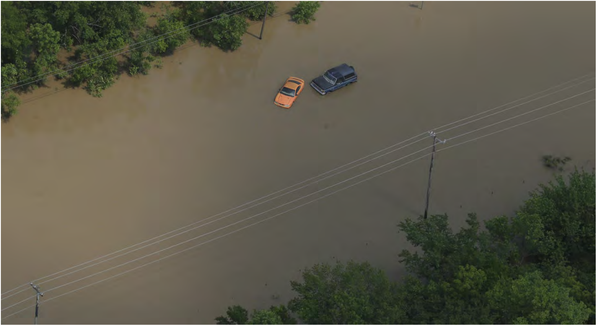
In this aerial image, cars are abandoned in flood waters on North Cincinnati near Skiatook, Okla., on Thursday, May 23, 2019. Storms and torrential rains have ravaged the Midwest, from Texas through Oklahoma, Kansas, Nebraska, Iowa, Missouri and Illinois, in the past few days.