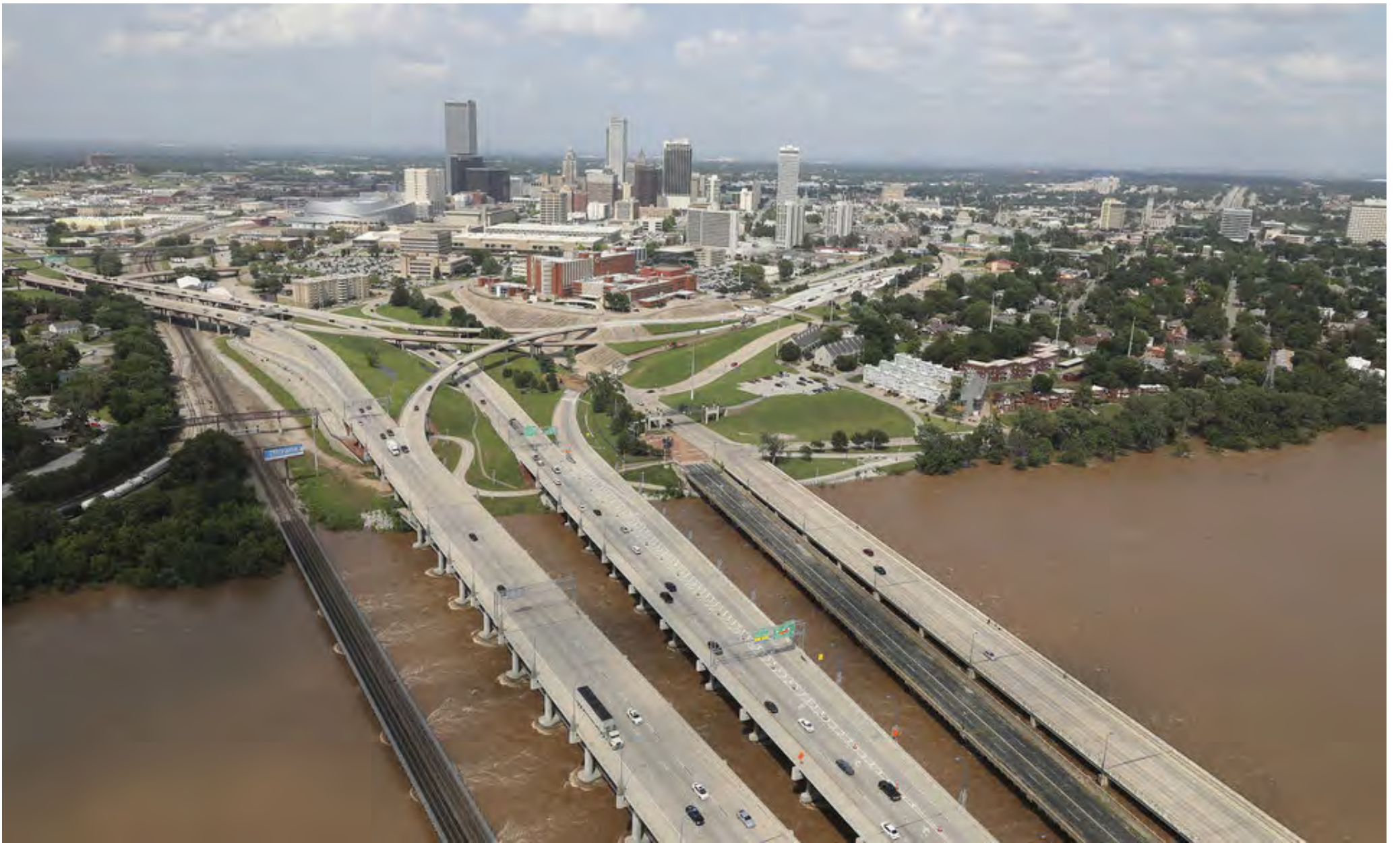
This aerial image shows the Arkansas River with the Tulsa, Okla., skyline after flooding on Thursday, May 23, 2019. Storms and torrential rains have ravaged the Midwest, from Texas through Oklahoma, Kansas, Nebraska, Iowa, Missouri and Illinois, in the past few days.