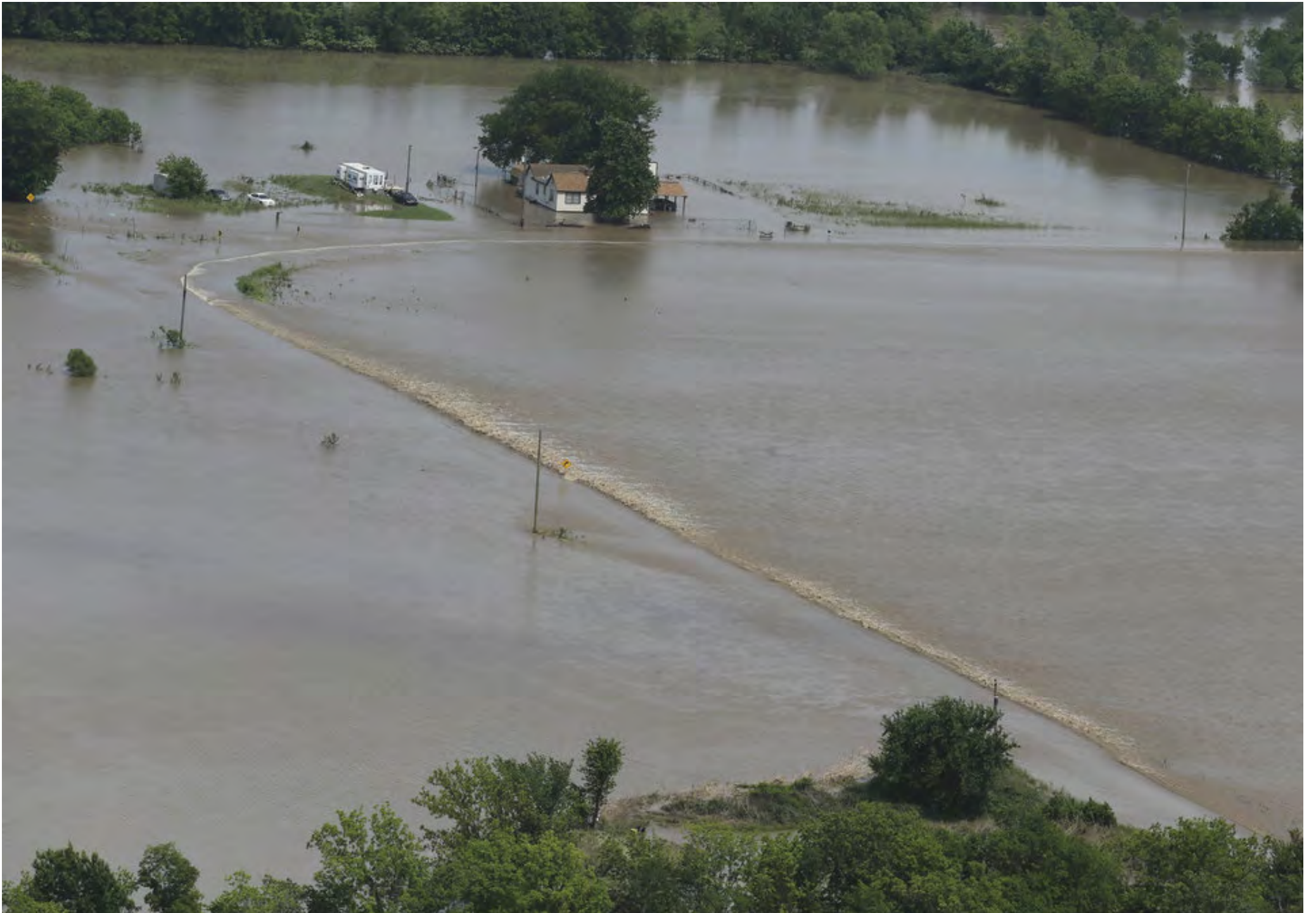
In this aerial image, flood waters closed a road near Skiatook, Okla., on Thursday, May 23, 2019. Storms and torrential rains have ravaged the Midwest, from Texas through Oklahoma, Kansas, Nebraska, Iowa, Missouri and Illinois, in the past few days.