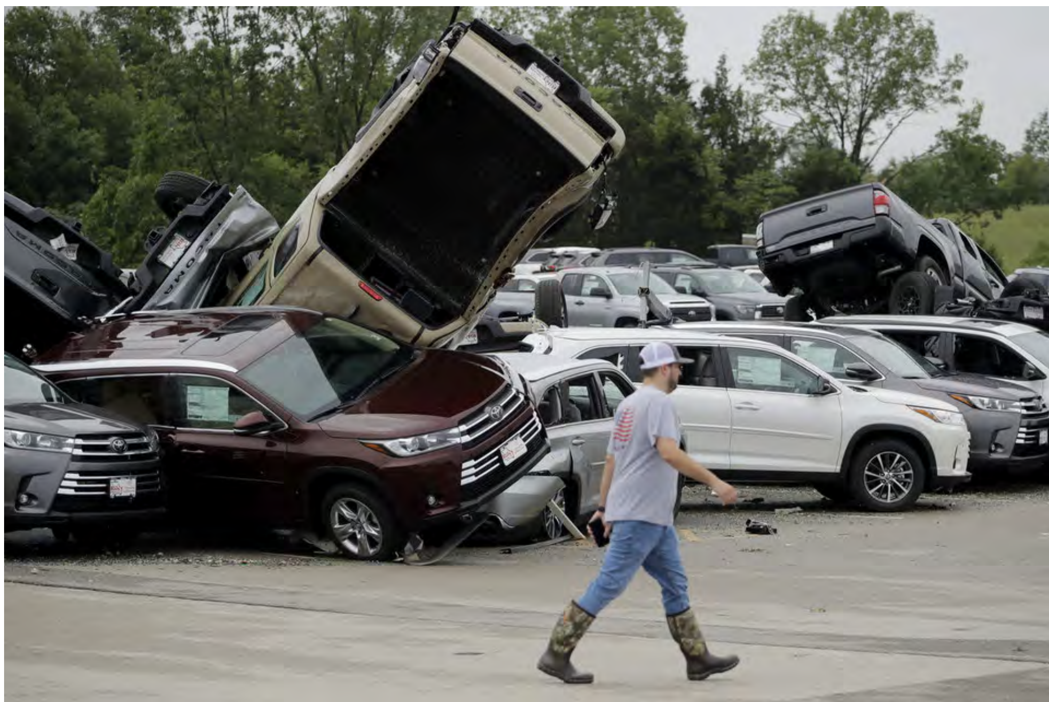
A worker walks past tornado-damaged Toyotas at a dealership in Jefferson City, Mo., Thursday, May 23, 2019 after a tornado tore through late Wednesday.