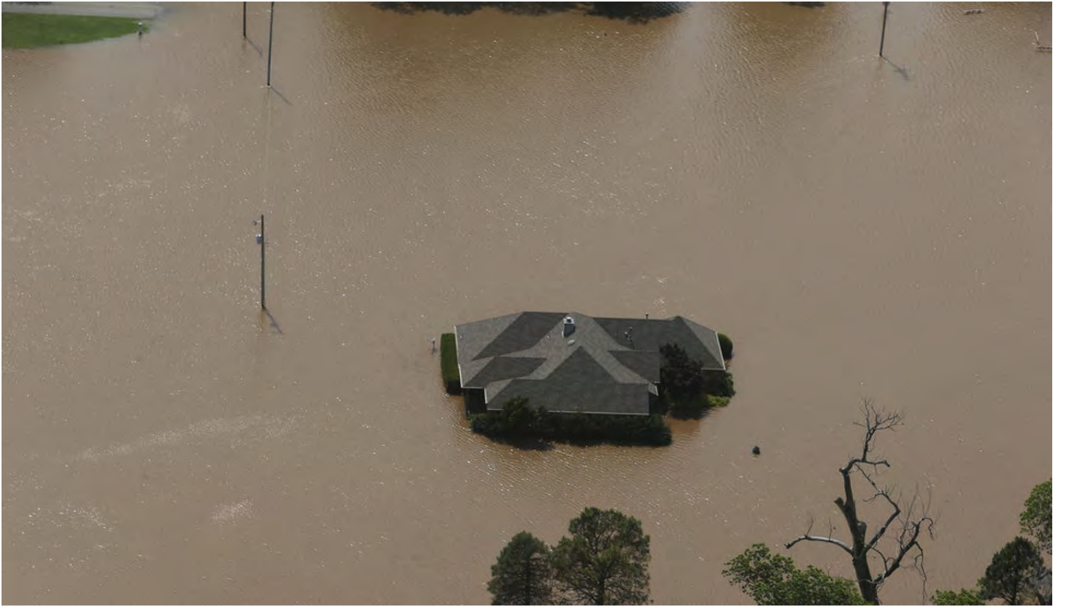
In this aerial image, homes are inundated with flood waters from the Arkansas River near South 145th West Ave. near Highway 51 on Thursday, May 23, 2019, in Sand Springs, Okla. Storms and torrential rains have ravaged the Midwest, from Texas through Oklahoma, Kansas, Nebraska, Iowa, Missouri and Illinois, in the past few days.