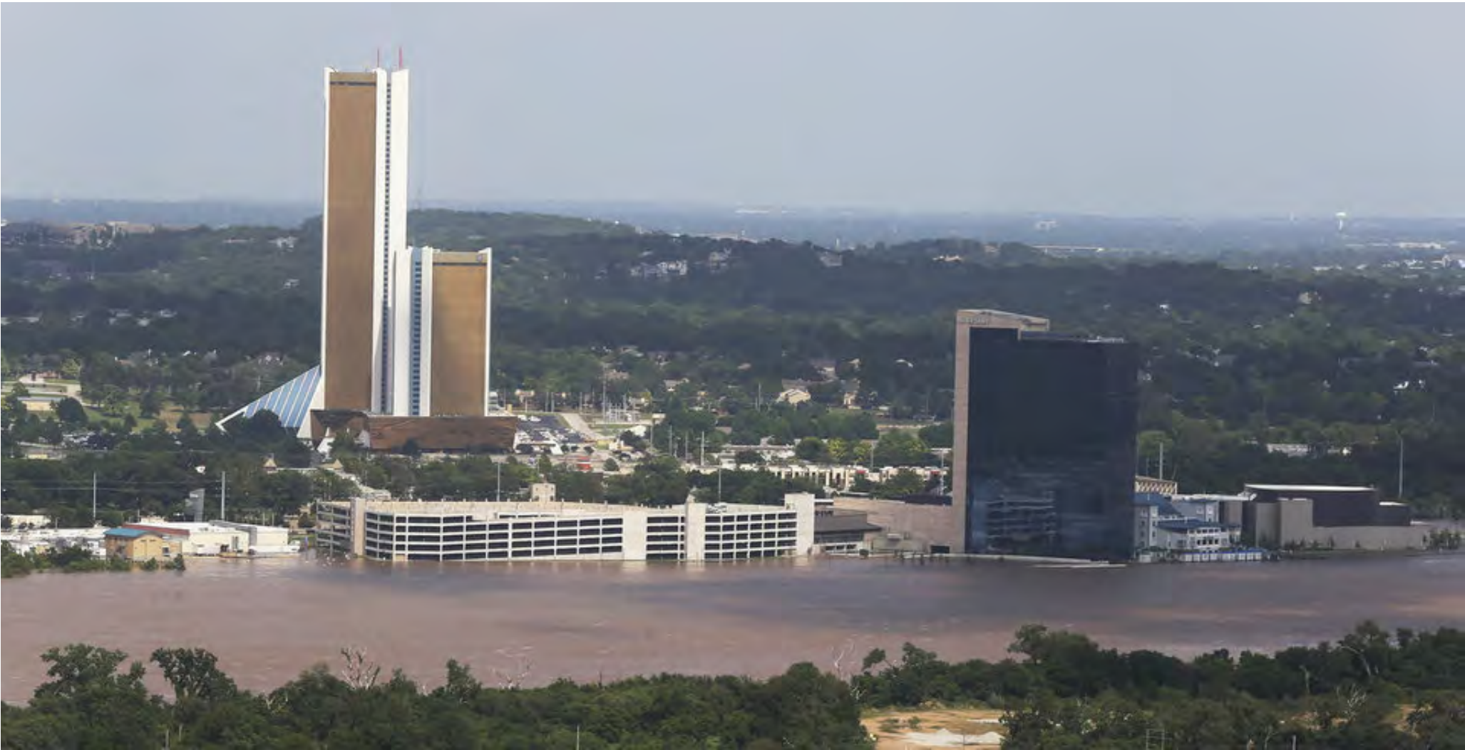
In this aerial image, the River Spirit Hotel and Casino after flooding on Thursday, May 23, 2019. Storms and torrential rains have ravaged the Midwest, from Texas through Oklahoma, Kansas, Nebraska, Iowa, Missouri and Illinois, in the past few days.