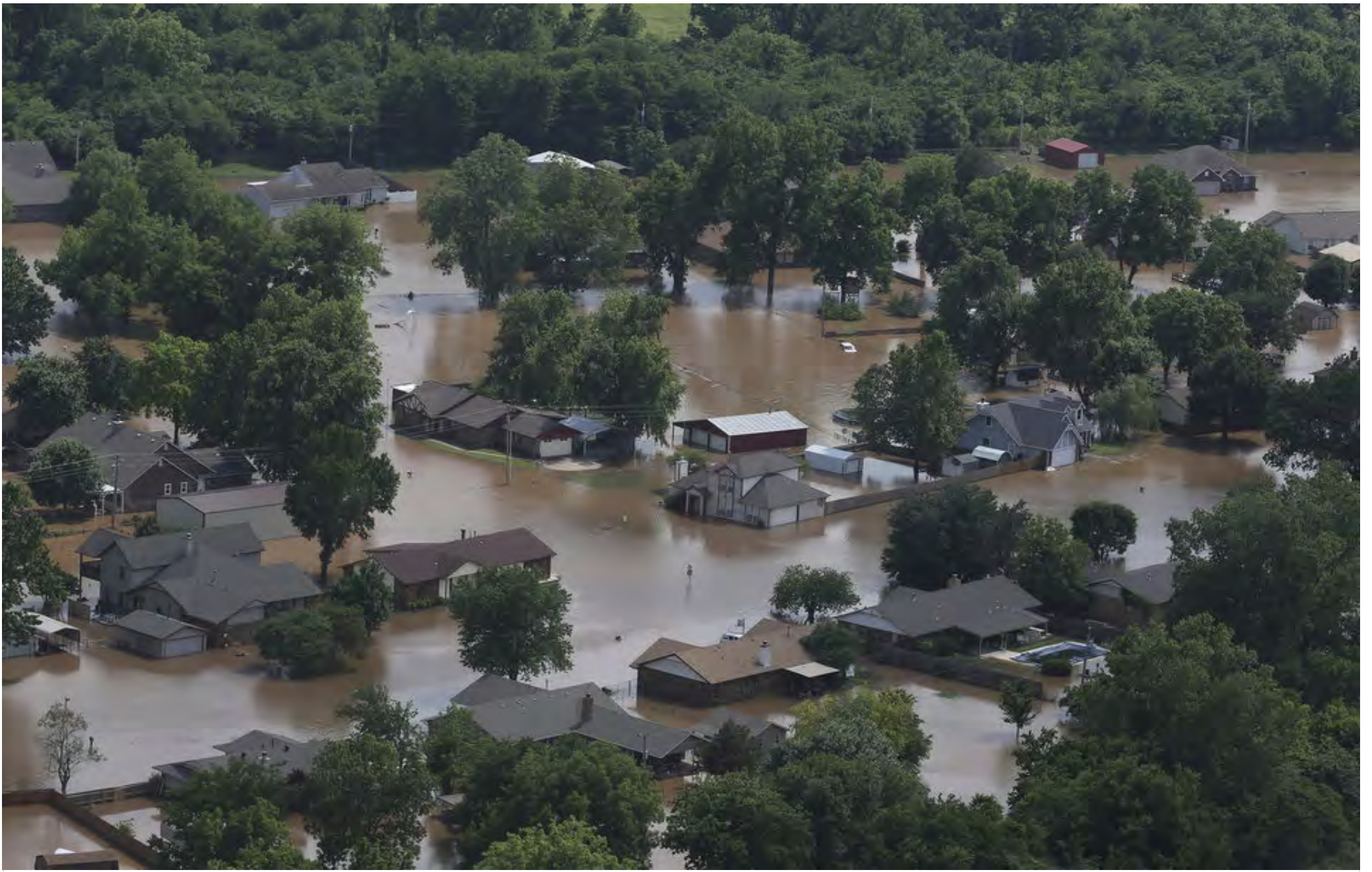
In this aerial image, homes are inundated with flood waters from the Arkansas River near South 145th West Ave near Highway 51 on Thursday, May 23, 2019, in Sand Springs, Okla. Storms and torrential rains have ravaged the Midwest, from Texas through Oklahoma, Kansas, Nebraska, Iowa, Missouri and Illinois, in the past few days.