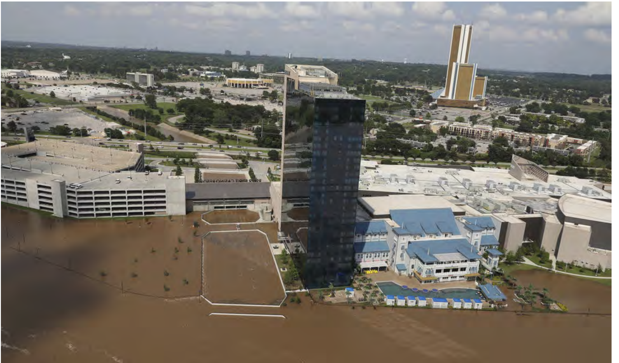
In this aerial image, the River Spirit Hotel and Casino are seen after flooding on Thursday, May 23, 2019. Storms and torrential rains have ravaged the Midwest, from Texas through Oklahoma, Kansas, Nebraska, Iowa, Missouri and Illinois, in the past few days.