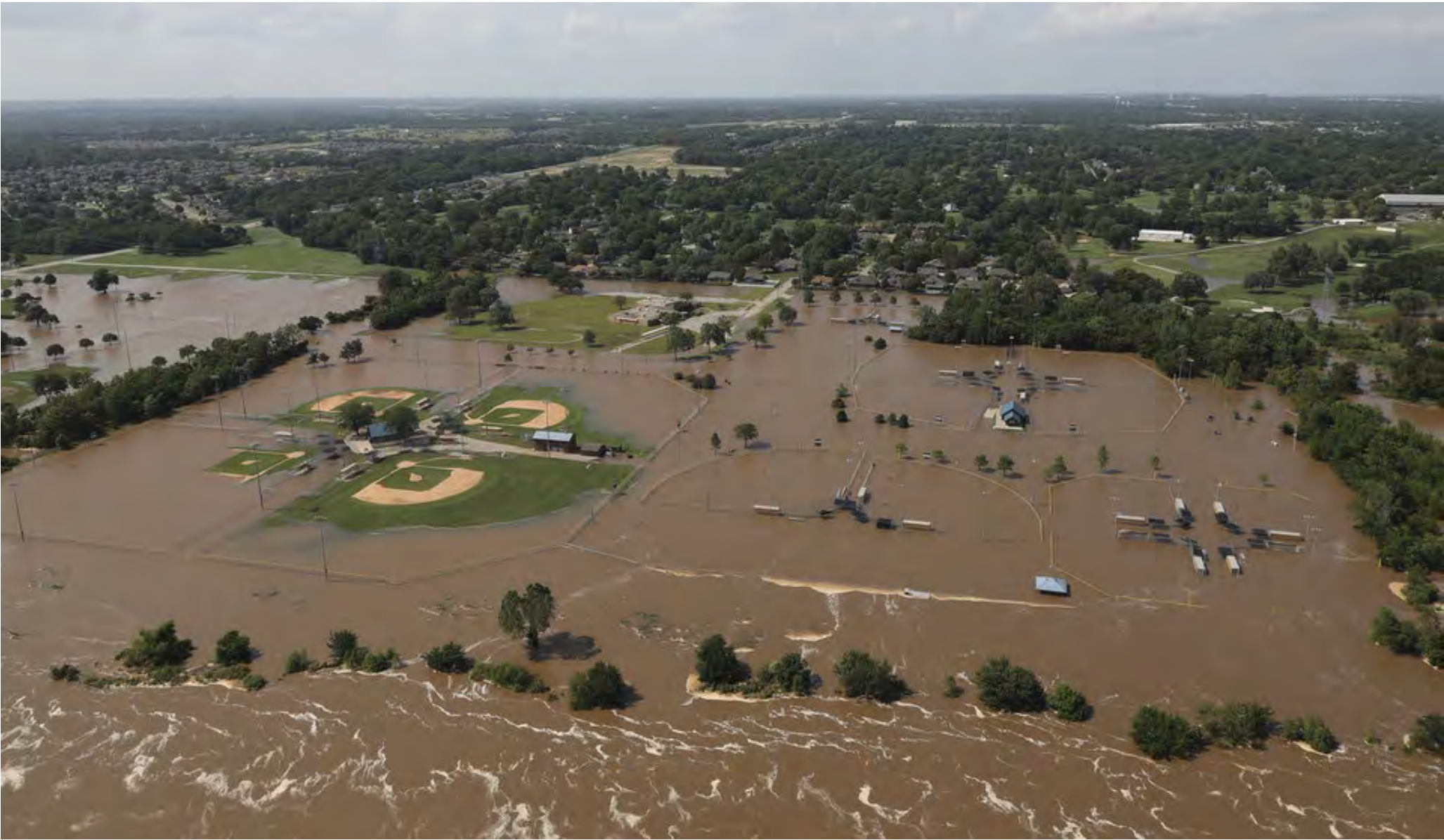
In this aerial image, the Indian Springs sports complex is under water after flooding from the Arkansas River on Thursday, May 23, 2019. Storms and torrential rains have ravaged the Midwest, from Texas through Oklahoma, Kansas, Nebraska, Iowa, Missouri and Illinois, in the past few days.