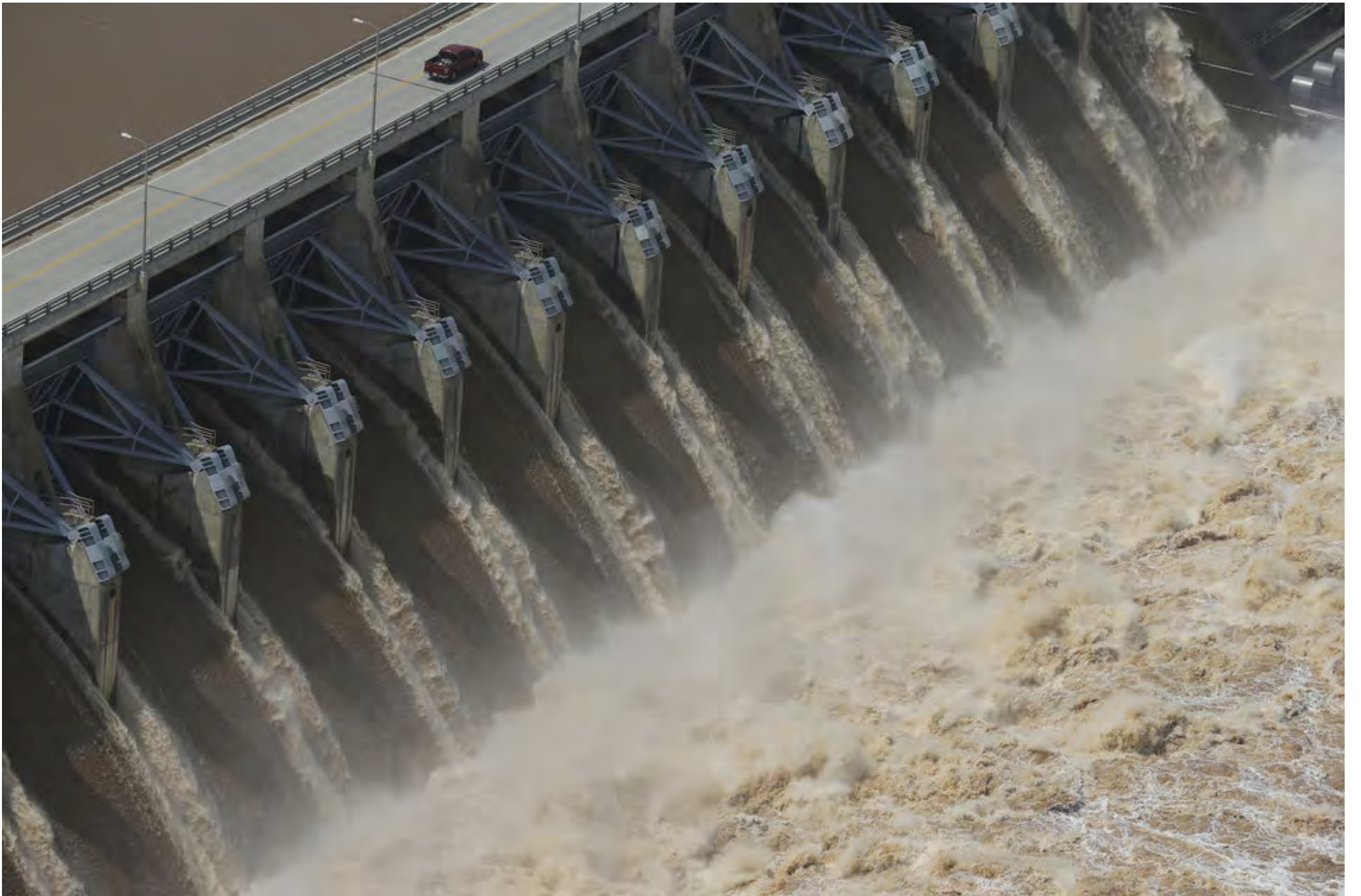
In this aerial image, water from the Keystone Dam is released on Thursday, May 23, 2019, in Sand Springs, Okla. Storms and torrential rains have ravaged the Midwest, from Texas through Oklahoma, Kansas, Nebraska, Iowa, Missouri and Illinois, in the past few days.