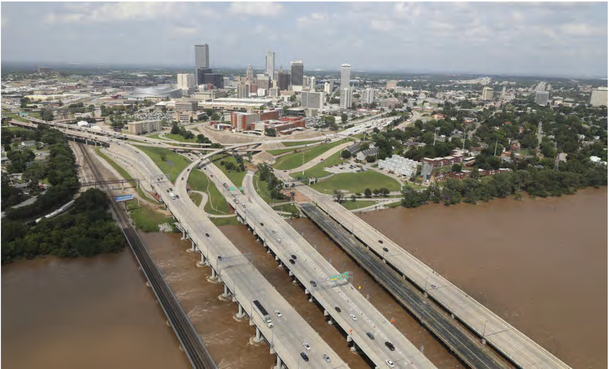
This aerial image shows the Arkansas River with the Tulsa, Okla., skyline after flooding on Thursday, May 23, 2019. Storms and torrential rains have ravaged the Midwest, from Texas through Oklahoma, Kansas, Nebraska, Iowa, Missouri and Illinois, in the past few days.