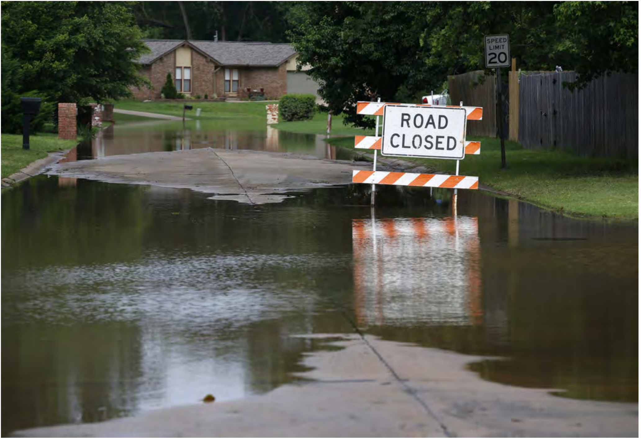
Floodwaters cover a stretch of road in the Indian Springs Country Club in Broken Arrow, Okla., on Thursday, May 23, 2019.