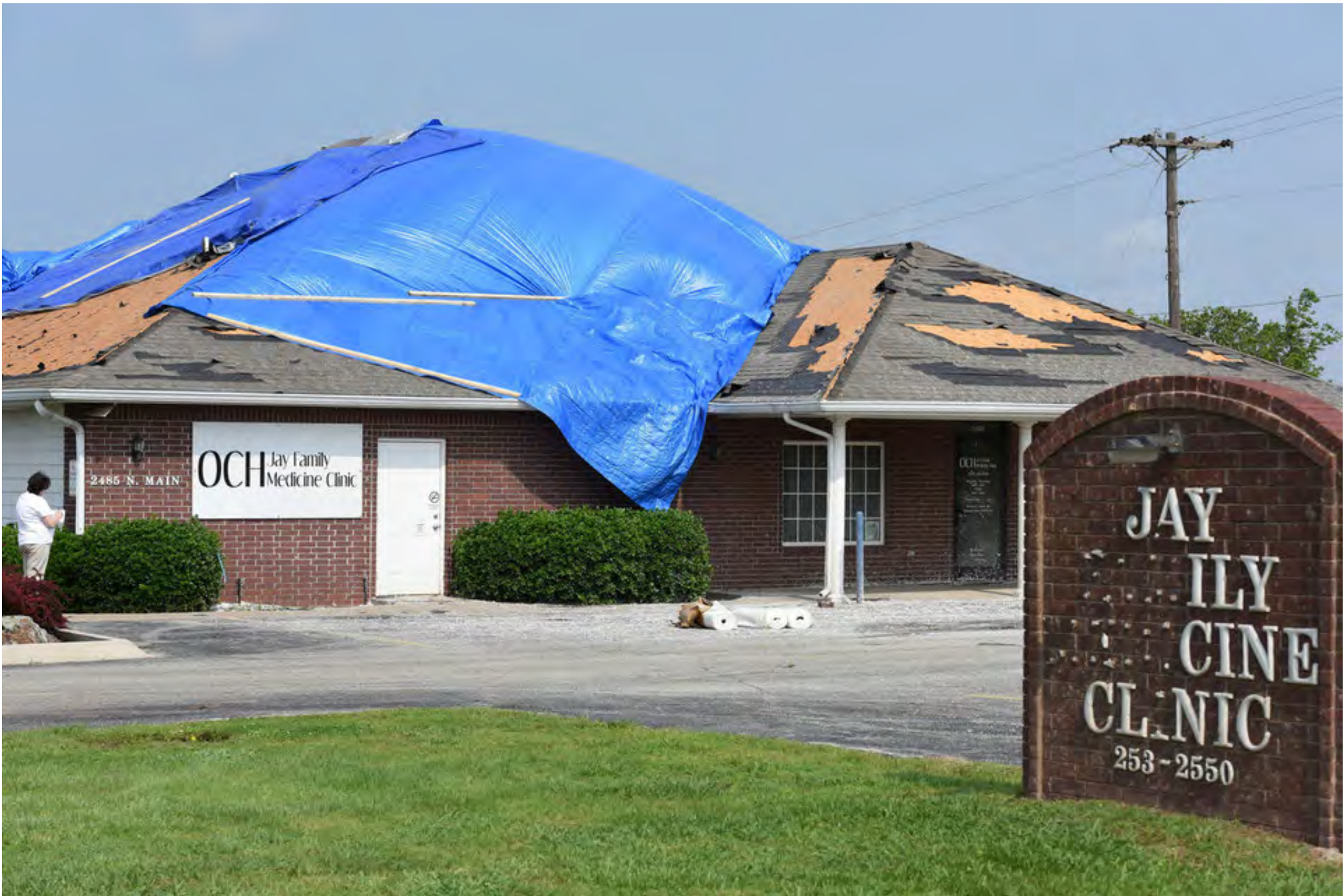
The Jay Family Medicine Clinic was heavily damaged by a tornado Wednesday night.