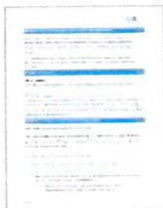
RFCDL Supplement PDF 153 KB

The "More Info" link below provides summary data about the commitments made to your company in this wave. Click on the date/time below to display the entire notification for easy printing. Please keep a copy of this notification for your records.