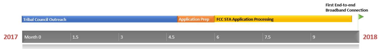
Figure 1: Timeline for The Havasupai Tribe's Network Deployment. Outreach took almost 5 months. Preparing the application was just one month, because funding was provided by MuralNet.