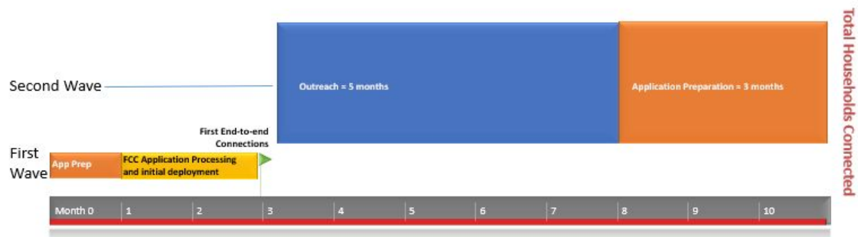
Figure 2: Predicted impact based on the two-wave model. Many more households on tribal lands will be connected if the Tribal priority window is extended.