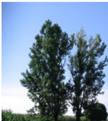
July 24, 2016 Note thinness in tree on right and bare spot developing between trees

The damage to trees is not theoretical. We are seeing it on our farm now. We have seen it in the city for years, but now we are seeing it in the country as well, on a widespread basis.