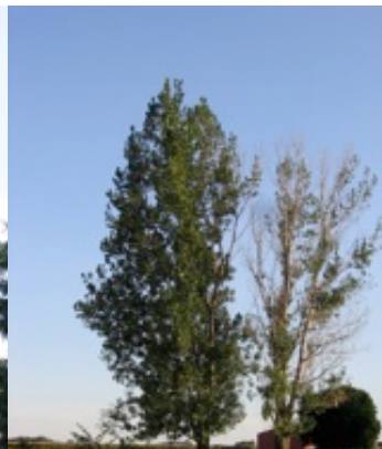
September 12, 2016 More leaves lost. No sign of healthy fall leaf color so fall is not the cause.