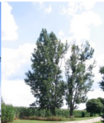
August 9, 2016 Damage progressing quickly