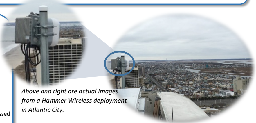
Above and right are actual images from a Hammer Wireless deployment in Atlantic City.

Has the ability to bond individual, small non-contiguous channels into one contiguous 450MHz wide channel.