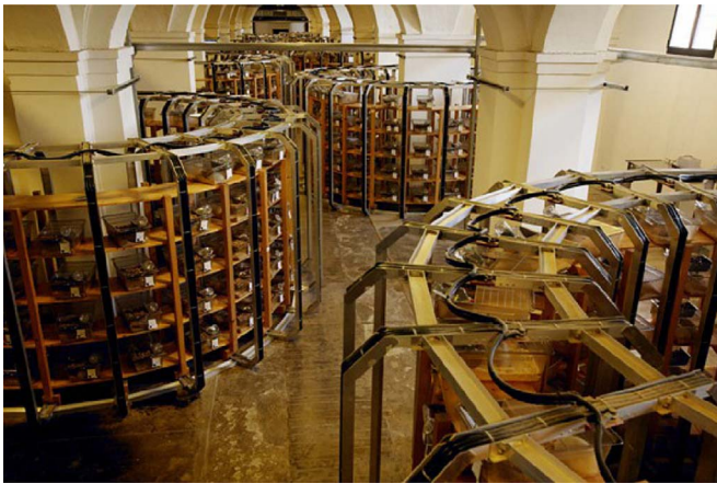
Fig. 1. RI studies on ELFEMF: exposure system. The exposure system was based on independent devices, each one serving at least 500 rats. The toroidal shaped device guaranteed the absence of interference between the structures. A wooden support structure for rat cages was mounted inside the toroidal magnet. Note that the toroidal structures were all located in a unique room of more than 900 m 2 , in order to ensure a homogeneous conduct of the experiments.