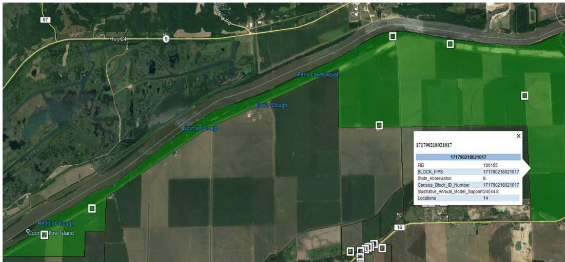
Figure 4. Satellite imagery of a CAF II auction census block.

The two examples are just a small sample of the many instances where Vantage Point has identified what appear to be substantial locations gaps in auction areas. Conversely, Vantage Point has not identified many census blocks (or census block groups) where model locations are less than the observable locations. As was noted in the 2015 Vantage Point study, in this environment (asymmetrical model deviation) model errors don't "balance out" over a large number of census block groups. Instead, those errors tend to compound, making the locations gap larger.