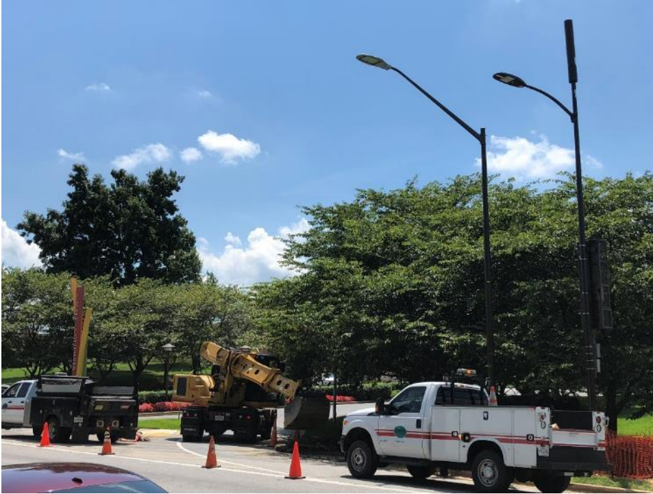
Photo 5 - Restoration by County after contract unable to clear construction debris from R-O-W

*Please note that the 900 pounds street light plus antenna weight does not include back-up batteries. Batteries substantially increase weight and introduce a chemical hazard which is over approximately, 10 feet over-head. Mitigation of battery hazards should be clearly detailed during permitting and inspected during construction.