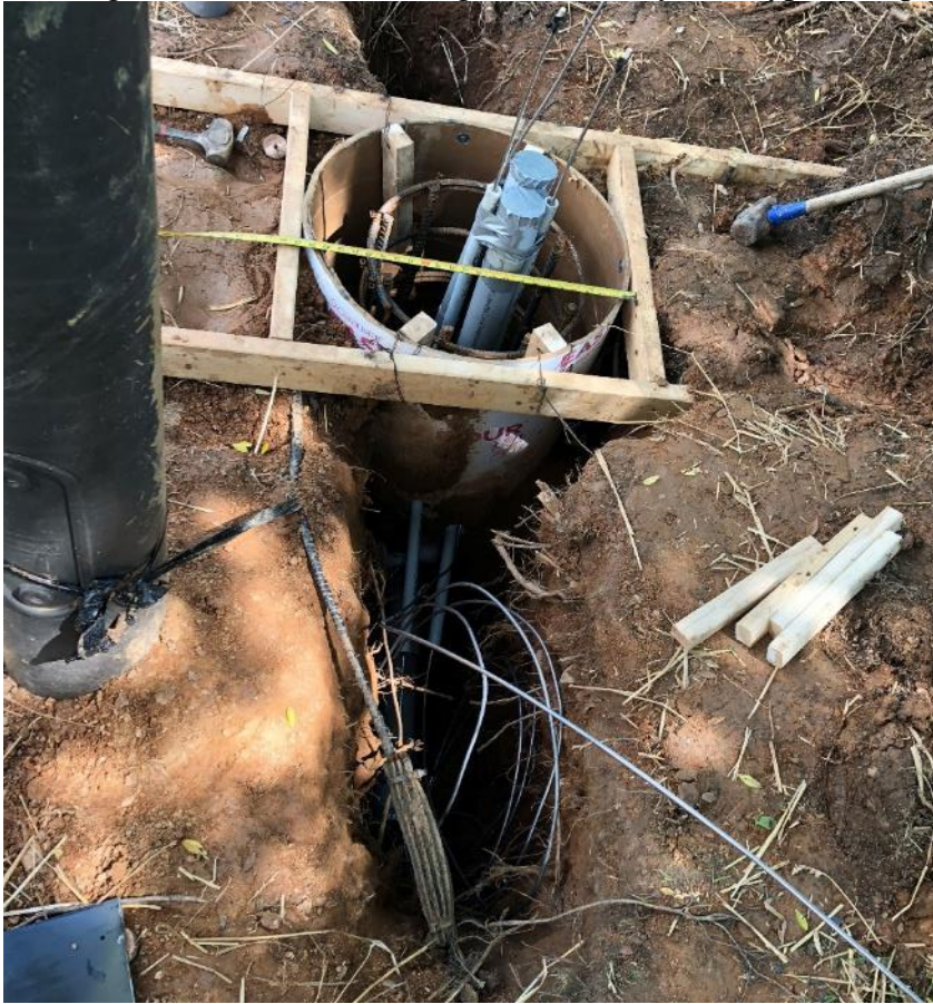
Photo 3 - Foundation hole with reinforcing steel