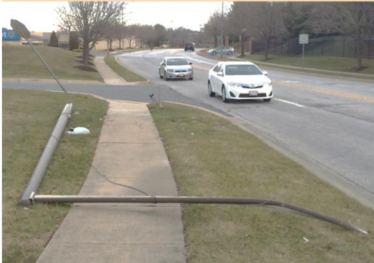
Photo 1 - Damaged Fiberglass Street moved by hand

The average kitchen refrigerator weights about 400 pounds. The outfitted 35' tall metal street light weighs twice as much as the average kitchen refrigerator. The drawings and construction need to address hazards to the traveling public.