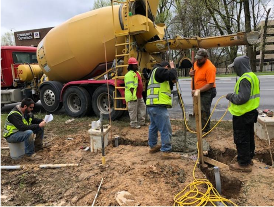
Photo 4 - Concrete Foundation Pour