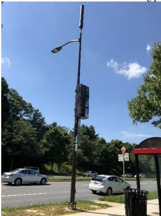
Photo 2 - Metal Street Light w/Antenna requires equipment to move

The average kitchen refrigerator weights about 400 pounds. The outfitted 35' tall metal street light weighs twice as much as the average kitchen refrigerator. The drawings and construction need to address hazards to the traveling public.