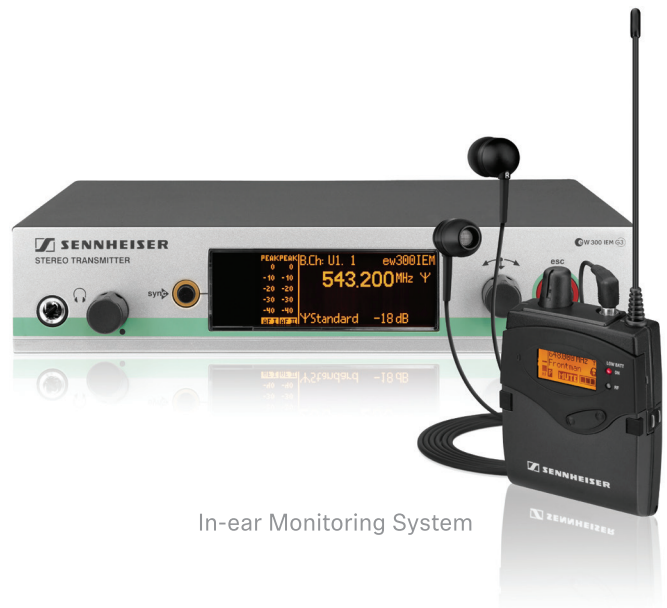
In-ear Monitoring System

UHF Channel 37 (608–614 MHz) has not been used for TV broadcast. Rather, it has been used for wireless medical telemetry (“WMTS”) (e.g., monitoring a patient’s vital statistics in a hospital). It has also been used in a few remote geographic areas for radio astronomy (“RAS”) studies. Wireless microphones have never been permitted to operate on Channel 37, and this is not changing.