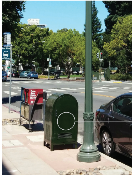
Ground equipment disguised inside boxes that look like green service mailboxes

in with the aesthetics of the area, we installed small, discreet nodes in the public right-of-way on existing streetlights. We also came up with an innovative solution to hide our ground equipment—it's disguised inside boxes that look like green service mailboxes. The new network has finally brought downtown Palo Alto's wireless service up to par with the rest of the city's technology. In fact, it's been such a success that we're already working on an expansion project nearby.