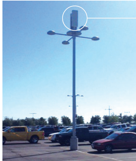
SCS are mounted on parking lot streetlights outside the stadium.