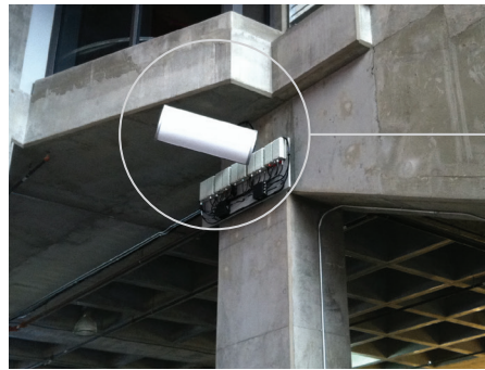
SCS are installed in ceilings at University of Phoenix Stadium.

The Big Game was, of course, the driving motivator for the upgrade, but we built the network with the future in mind. By using a neutral host infrastructure, we made it easy for additional wireless carriers to be accommodated without having to install separate systems. And, with the nearly limitless capacity of fiber, we ensured that the stadium and surrounding venues will continue to be served well beyond the Big Game.