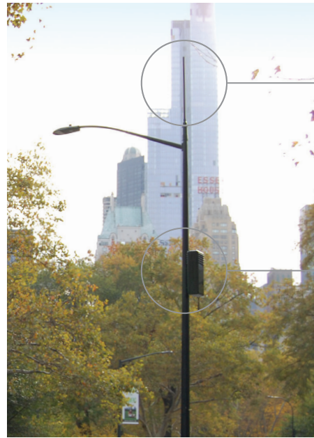
SCS installation on Central Park streetlight.

To meet the wireless demands of the many visitors who frequent the park, we settled on a fiber-based solution—giving us essentially unlimited capacity to build our SCS network. It is also a forward-looking solution, since future upgrades won't require installing additional cable. To preserve the park's natural beauty, we placed nodes on a variety of existing infrastructure, from streetlights to signposts—helping to maintain the park's main draw as a beautiful retreat in a bustling city. Like all the SCS networks we build, it's a neutral host solution, so all wireless carriers can take advantage of the new system without unnecessary infrastructure. With everything in place, Central Park now has the capacity to meet the voice and data needs of the many tourists and New York City residents.