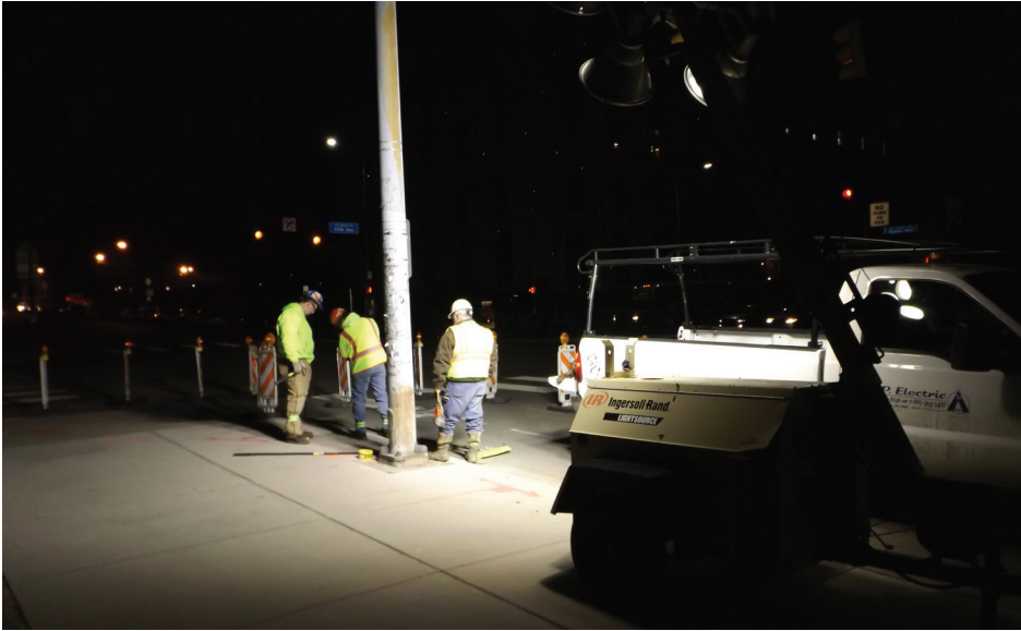
Workers in action, installing fiber to connect to SCS.

To meet the high, concentrated data demands of the neighborhood, we installed a fiber-fed small cell solutions (SCS) network. We connected the network to a hub at an existing macro site in the neighborhood—eliminating the need to install new equipment. New streetlights allowed us to hide the nodes from public view and add to the aesthetics of the neighborhood. This was especially important near historical sites, where it was necessary to win the approval of the City's Public Works Department and Arts Commission. The entire project was completed at night and during off-peak hours in order to minimize disruption to the neighborhood. In the end, the only thing residents noticed was the attractive new streetlights—and, of course, their improved wireless service.