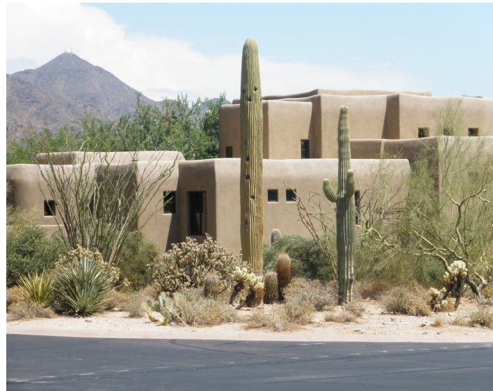
Camouflaged cactus (left)