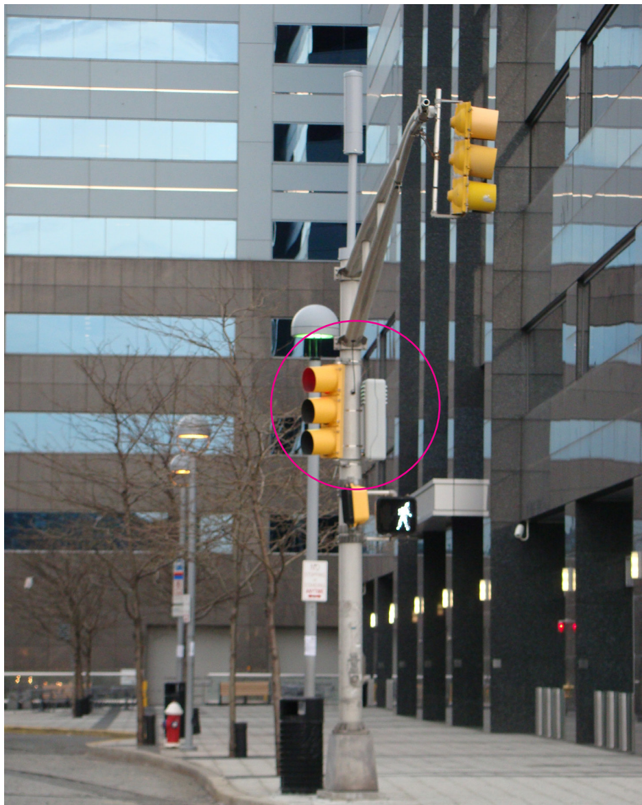
Traffic light (Jersey City)