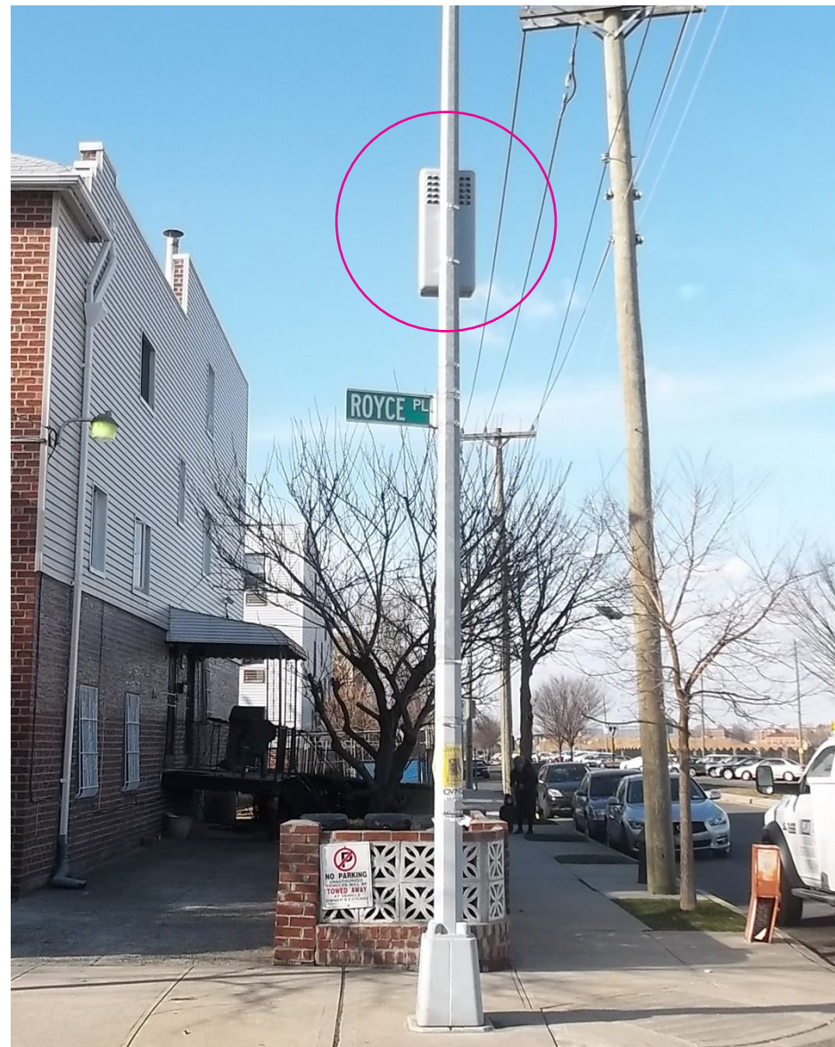
Street light (Brooklyn)