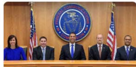
October 2019 Open Commission Meeting fcc.gov

Did you miss the October 25 Open Meeting that included agenda items on rural broadband quality, 911 fees, broadcast antenna siting, and the 800 MHz spectrum band? Watch the video here: go.usa.gov/xVHPy #OpenMtgFCC #broadband #spectrum