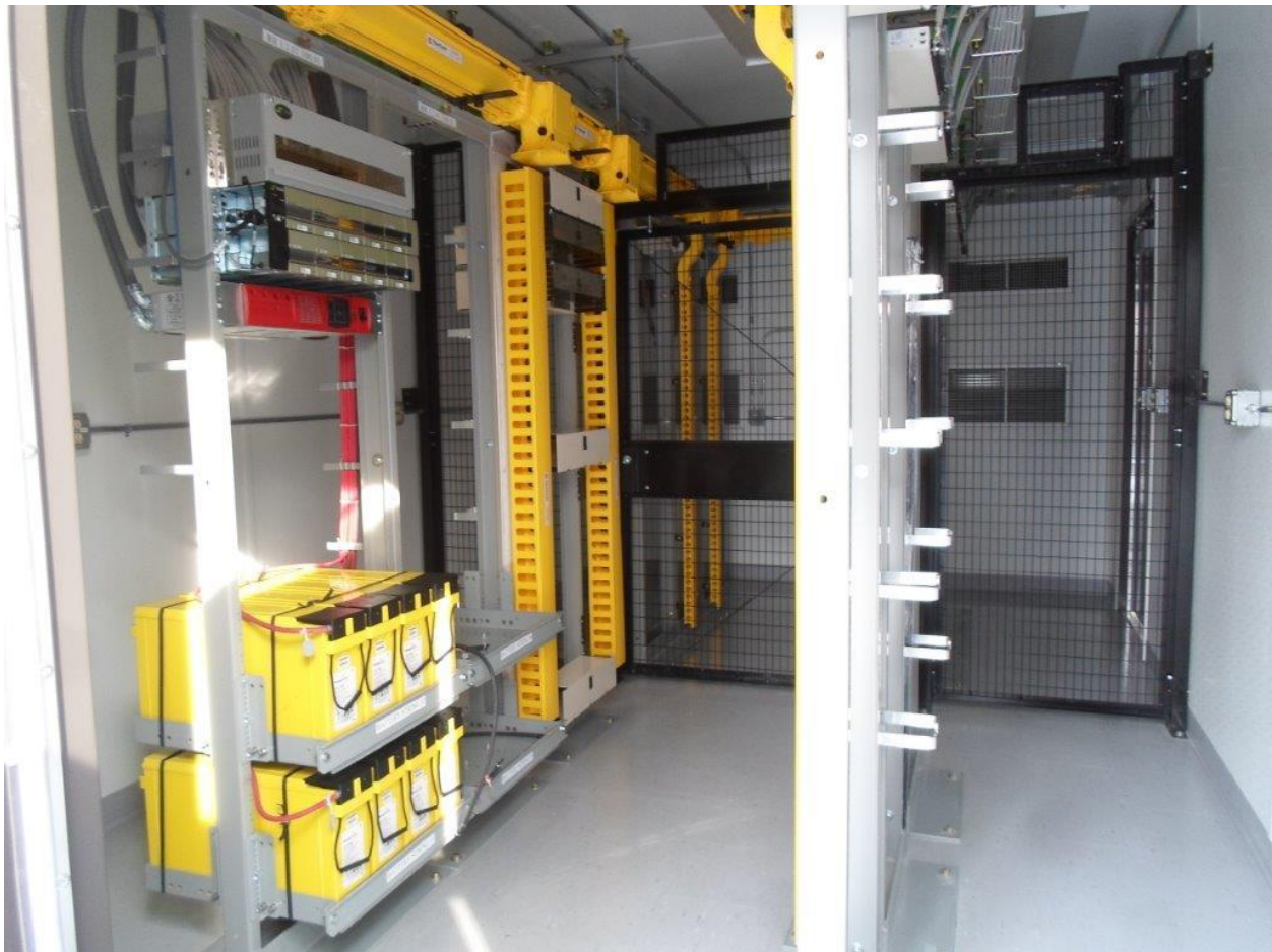
Typical Shelter Interior

The network would incorporate eleven communications huts along the two-ring topology; these huts would house the electronics required to drive the network. Each of these huts is an 8'-by-20' pre-constructed, concrete shelter, able to withstand a Category III hurricane. Each will have self-contained air conditioning/heater units, 19" racks, and 100 amps service panels. We will install rectifiers and batteries sufficient to support a 20-hour run time, a generator and complete environment and security monitoring.