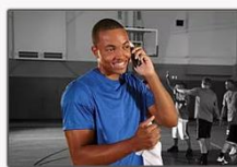
Voice users calling anyone