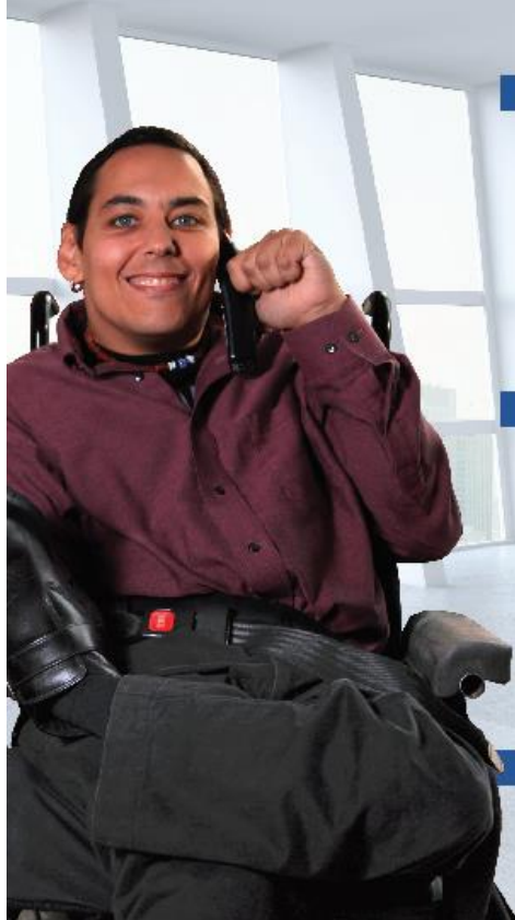
Delaware Relay Service – Speech to Speech